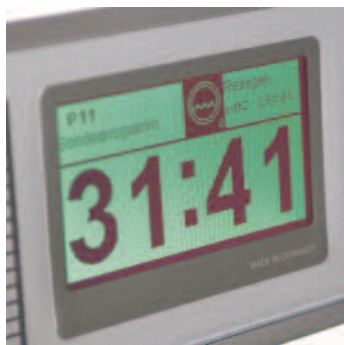
Easily viewed from a distance: the large-display remaining cycle time