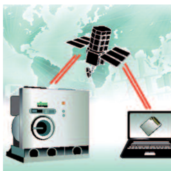
With BÖWE Direct Connect remote maintenance is possible