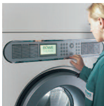
Easy-to-operate to the smallest detail

The control can easily be updated by reading from a standard MMC or SD card.