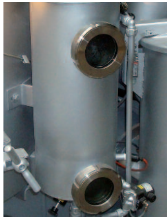
Free of maintenance: the self-cleaning water separator with integrated post water separator

still rake out system utilises a physical / chemical principle that guarantees that the residues are pumped off practically without any solvent.