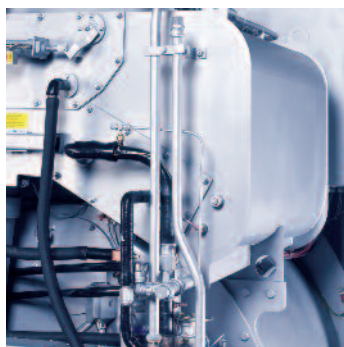
Aerodynamic recovery section for extremely smooth operation