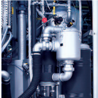
The SLIMSORBA adsorption unit

With the fully integrated SLIMSORBA adsorption unit you will achieve odour-free garments and an especially low residual solvent concentration.